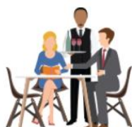
Leisure & Hospitality