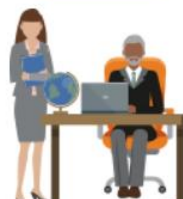
Professional & Business Services