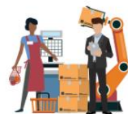
Wholesale & Retail Trade